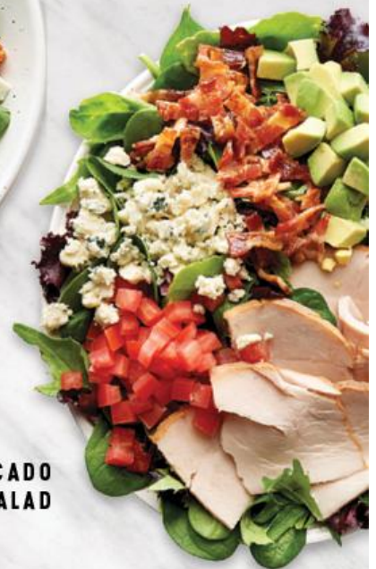
TURKEY AVOCADO COBB SALAD

VISIT ONE OF OUR 26 OPEN SOCAL LOCATIONS, OR ORDER ONLINE FOR PICK UP OR DELIVERY