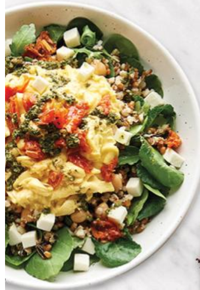
POWER BREAKFAST EGG BOWL